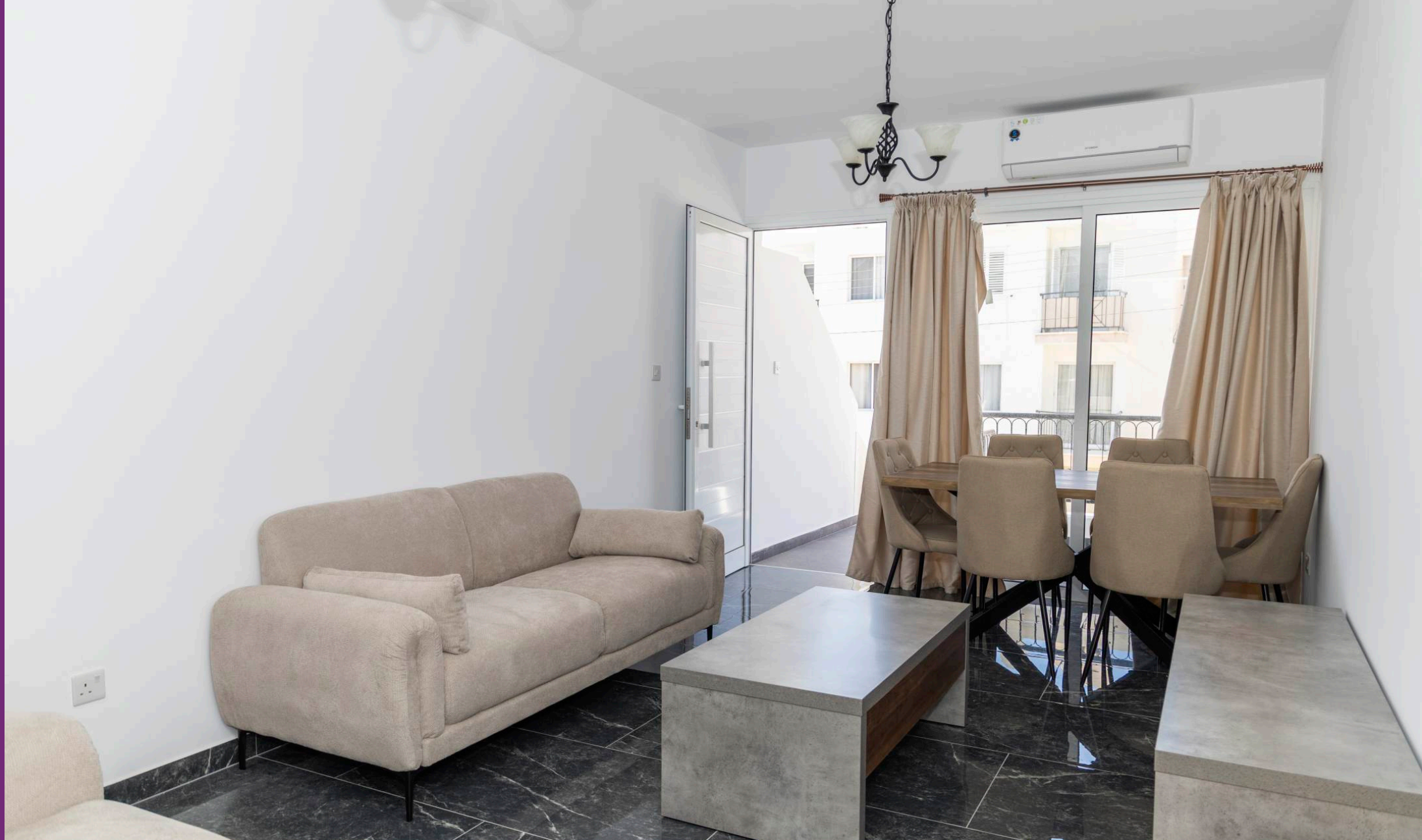
TOWNHOUSE A-PC-004 105 BLK 1 PHAROS COURT D